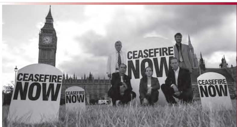
Martin Bell- former MP and war correspondent- with representatives from Care International, Muslim Council of Britain, Save the Children and Oxfam outside the British Houses of Parliament

Partners engaged in ad hoc alliances on individual pieces of work that enabled Crisis Action to respond quickly and effectively to a rapidly changing situation.